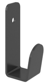
Metal hook for clothes